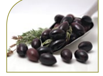
kalamata levande breaking the boundaries of the traditional flavor of the kalamata olive, we have added a hint of levanda leaves to create an innovative product