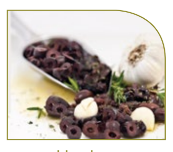
aegean blend our exclusive recipe of kalamata olive wheels, garlic, rosemary, oregano, savory and extra virgin olive oil perfected one of our most anticipated blends